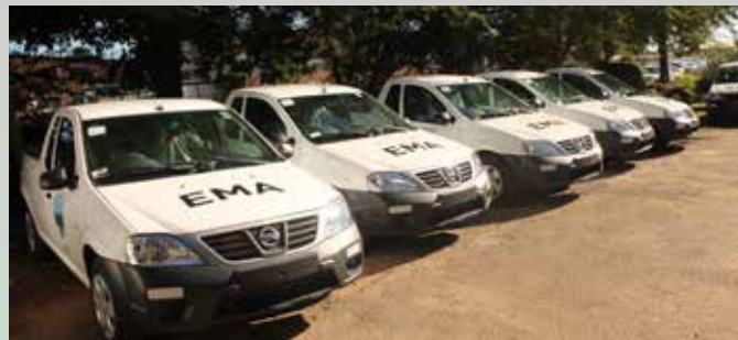
Part of the recently procured EMA fleet for ease of execution of duty.

Other departments within the Agency include the Human Resources, Audit and Risk as well as the Procurement Management.