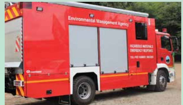
The Agency procured a state-of-the-art Hazardous Materials (HAZMART) Spill Response vehicle for the effective management of accidental spillages of hazardous substances in transit.