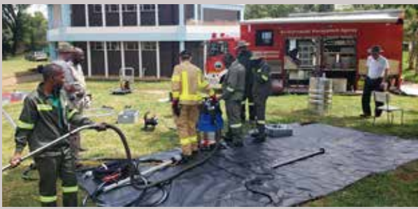
Training of EMA staff on how to use the recently procured HAZMART spill response vehicle.