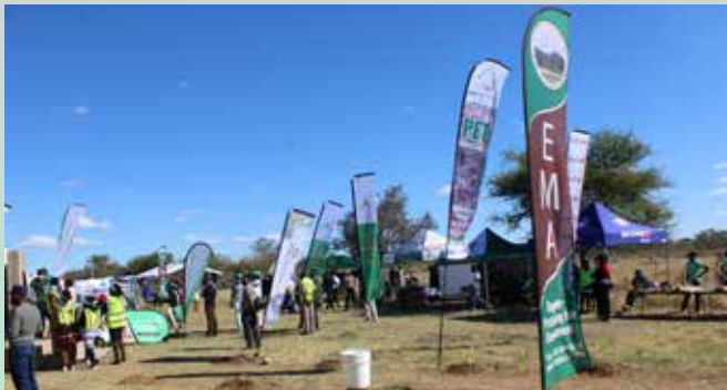
EMA raises environmental awareness through commemoration of environmental days together with stakeholders

The department is mandated to collect, produce and disseminate environmental information. It consists of two units; the Environmental Education and Publicity Unit and the Environmental Planning and Monitoring Unit