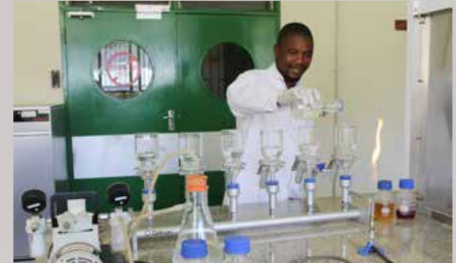
EMA laboratory provides soil, folia and water testing services